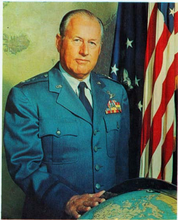
General Thomas S. Power Commander-in-Chief Strategic Air Command

Today, the command is a true aerospace force combining the mechanical advantages of the finest in bombers and missiles with