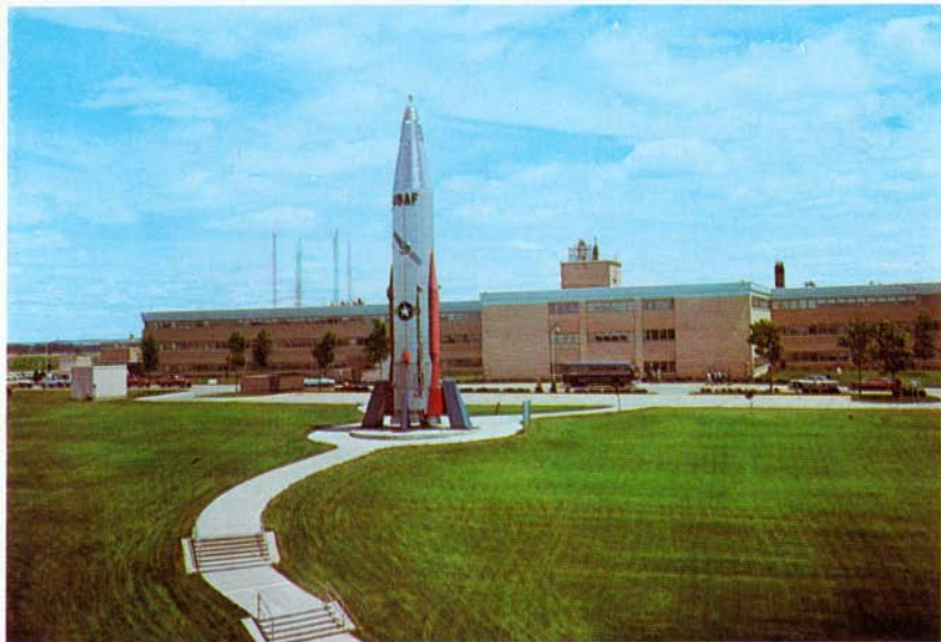
ABOVE—Atlas Missile and SAC Headquarters — “Trade-marks” of Offutt AFB.