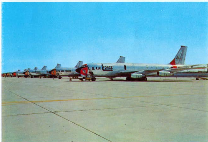
BELOW—Gleaming KC-135 jet tankers of the 34th Air Re-fueling Squadron.